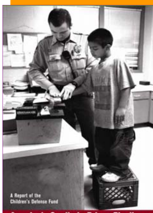
A Report of the Children's Defense Fund